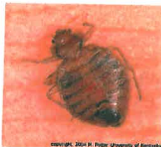
An adult bed bug, Cimex lectularius

Adult bed bugs are about ¼ inch long, oval, reddish-brown, and wingless. Their body is very flat, and they possess long, slender legs and antennae. They have a long, segmented proboscis (beak) that extends forward when the bug takes a blood meal. At rest, the proboscis lies beneath the body and projects backwards between the legs.