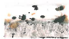
Bed bugs on a carpet