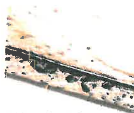
Bed bugs on a mattress seam